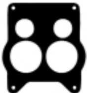
OL4V-G 4BBL QuadraJet