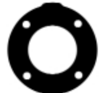
7296 Crusader Stainless Steel Plate Block Off (fresh water)

Manifold to Cylinder Head Gasket Big Block V8 383-440