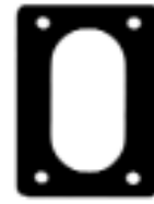
CY-MG 2BBL Rochester

Manifold to Cylinder Head Gasket In Line 6 Cylinder