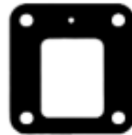
60207 Mercruiser Stainless Steel Plate with Weep Hole (raw water)