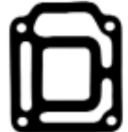
6022 Chris Craft