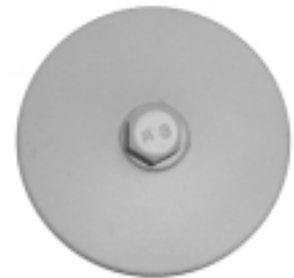
5" 4885-1A Includes gasket