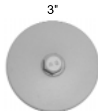
3" 4883-1A Includes gasket