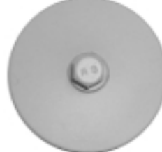
4" 4884-1A Includes gasket